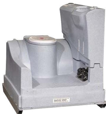
Formit Executive Foot operated